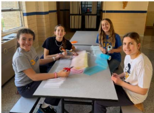
Upper Campus students preparing supplies for basket building day!

We are incredibly thankful to all who helped and supported this project as we live out Christ's commandment to love thy neighbor!