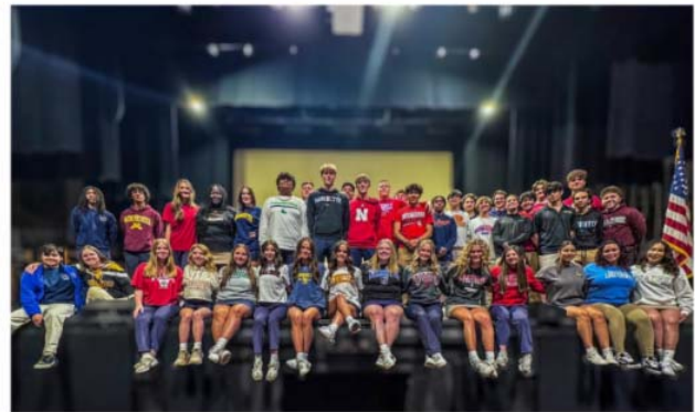
Class of 2025 representing the higher education institutions they will be attending in the fall.

May 1 st was College Decision Day for our outgoing class of 2025! All of our students wore their college gear for a picture and celebration of Grandparents Day. We pray that all of our seniors have a prosperous college experience and we pray for all of our students as they enter final exams!