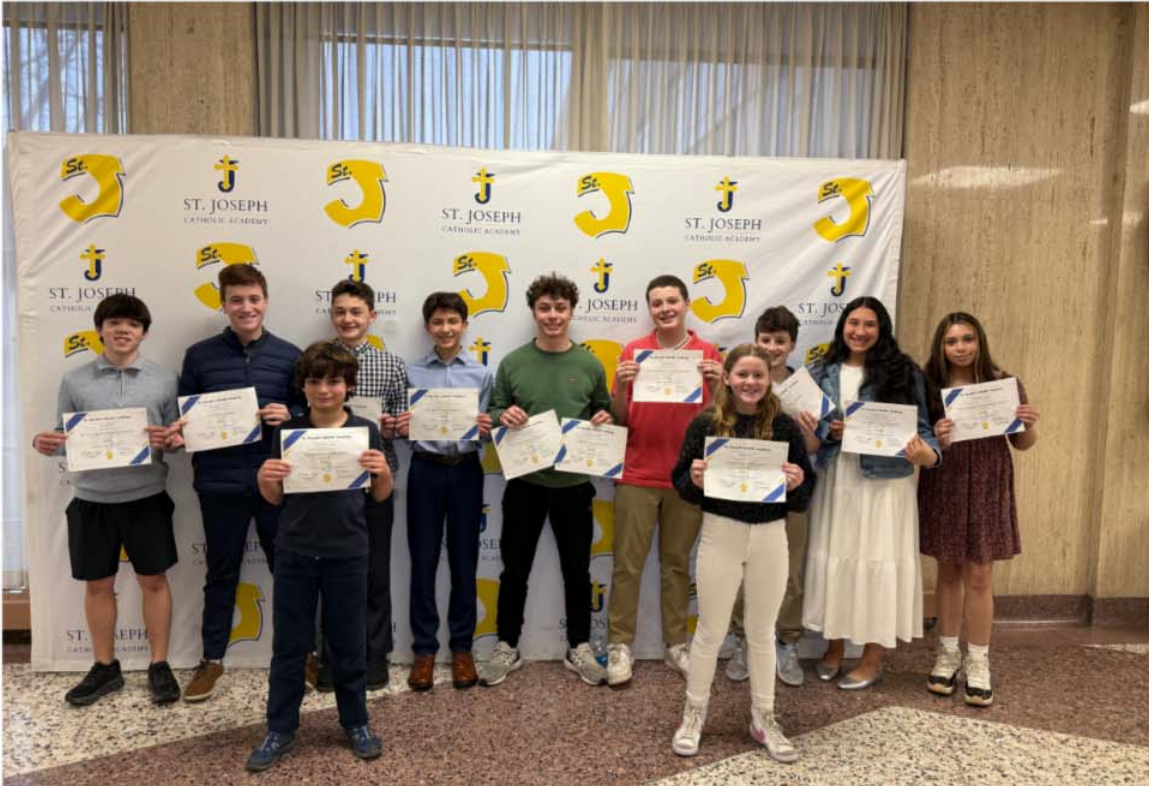
Upper and Lower Campus scholarship recipients. Not all award recipients present for photo.